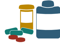
Medication & Medical Supplies

There will be variations of help-seeking behavior from abuse victims—some may readily seek out help while others may get lost in the crowd and seek support after the disaster has passed.